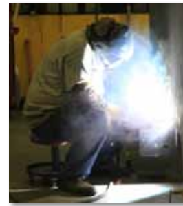
A welder at SpecSys in Benson