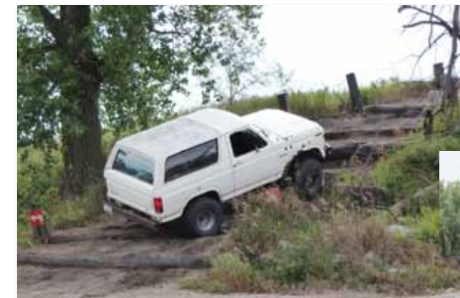
A guest at the Annual Gathering tries out his 4x4 on a timber-covered stairway at the Appleton Area OHV Park.

Guests were treated to a picnic-style meal of brats and hot dogs in one of the shelters at the OHV Park. We also used this area to set up a Prairie Waters display and distributed information about the park and other recreational activities available in the region. The evening ended with door prize drawings, and those still in attendance were treated to prizes donated and collected by board members from businesses around the region.