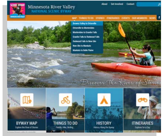
New mobile friendly website!

This is the third year of the ongoing geocaching project called "Who's Who in the U.S. – Dakota War of 1862" which continues to be popular with visitors.