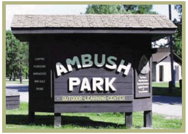
Welcome sign in Ambush Park

The park was created to provide a place for people to relax and enjoy being outdoors. The park has many amenities such as camp sites, picnic tables, free mini golf, historic buildings walking trails, and a butterfly garden.