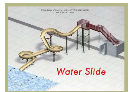
Both photos from the Benson City website

Financial Sustainability: The pool takes a loss in operating costs each year. The pool is about $100,000 to operate each year but makes only $55,000 in revenues. The other $45,000 comes from the city's General Fund and a further $25,000 to $30,000 is taken for maintenance. The city has a contract with the Community Education department at the school, which has the responsibility to staff the pool and take care of planning events and running swim lessons. The city does this to cut operation costs of the pool.